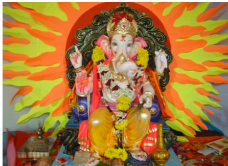
Ganeshii decorated by our Art teachers and students

Ganesh Chaturthi celebrations in school enlightened everyone with knowledge wisdom and strength, the celebrations over five days raised the spiritualness amongst the students with aarthis and bhajans in morning and evening , the visarjan took place with boarders bashing dance and song