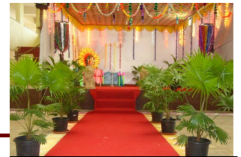
Decorative look of Pandal in the atrium

Parents are requested to contact the respective members for any queries marking a copy of your mail to dypspis.boarding@internationalschool.in