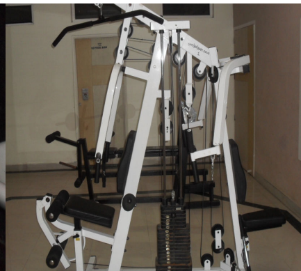
Open air gymnasium installed in the boarding house