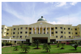
DYP-SPIS Boarding house Charoli Budruk, Tal.Haveli Via. Lohegaon, Pune, Maharashtra India 412 105