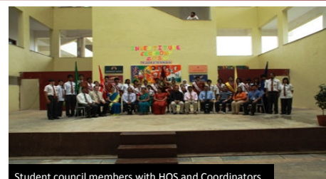
Student council members with HOS and Coordinators