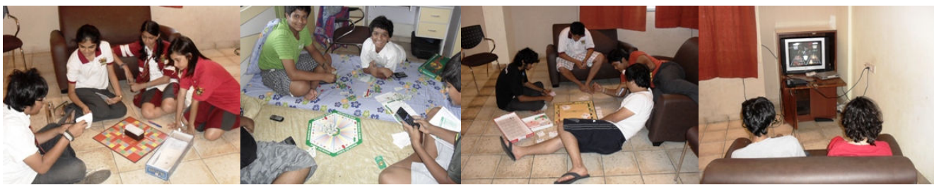
Stock Market , Monopoly Board games and Play station were catching our boarders interest