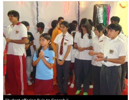
Student offering Puja to Ganesh ji