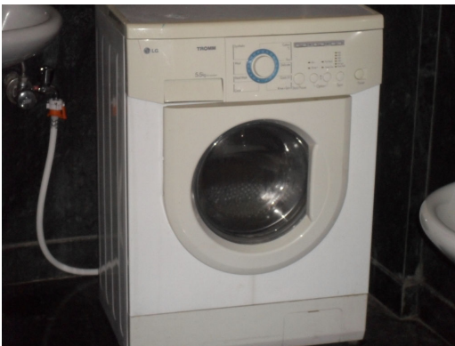
Washing machine installed in the washroom clusters for the boarders.